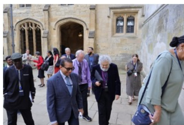
2024 BSIR Fellows and Scholars walking to the dining hall at Christ Church, Oxford, after the meeting's opening session